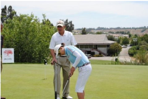
Golf Instruction 高尔夫课