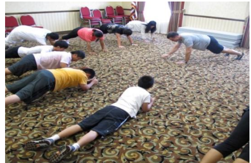
Golf Fitness 体能课程