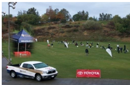
Tournament Play 赛事安排